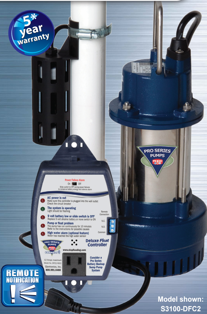
Model shown: S3100-DFC2