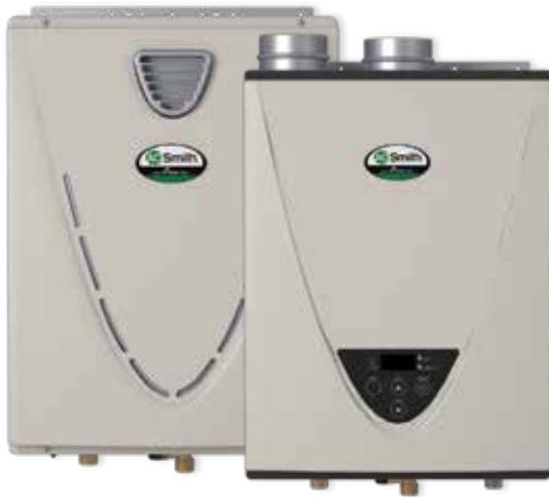
240 OUTDOOR MODEL 240 INDOOR MODEL