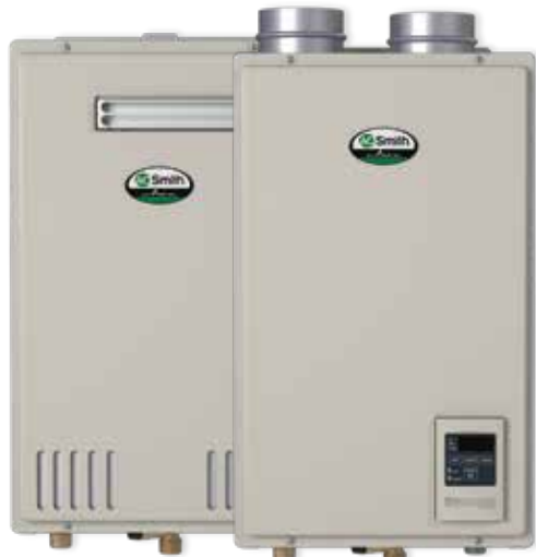
140 OUTDOOR MODEL 140 INDOOR MODEL