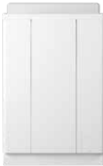
TABLE TOP MODEL