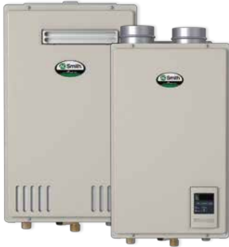
140 OUTDOOR MODEL 140 INDOOR MODEL