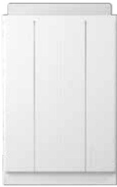
TABLE TOP MODEL