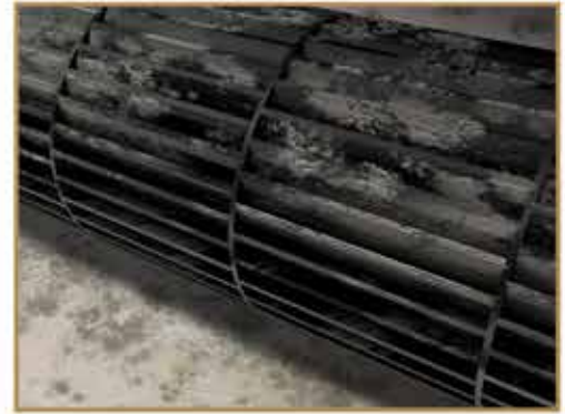
Mini split blower wheel with mold.