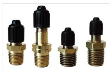
SN18NL, SN18LNL, SN25NL, SN25LNL