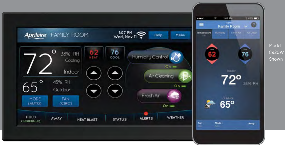
Model 8920W Shown