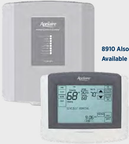
8910 Also Available

The Aprilaire 8900 Series IAQ Control Thermostats consist of two components, the User Interface and the Equipment Control Module. The User Interface, located in the living space, integrates all indoor air quality functions – heating/cooling, humidification/dehumidification, air cleaning and ventilation in one attractive, easy-to-use, touch screen control. The User Interface offers homeowners the ability to easily set all of their IAQ and HVAC products from one location in the living space. The primary screen indicates how to easily activate and control set points. In addition, the display provides the homeowner with confirmation that the equipment is operating at the desired control settings.