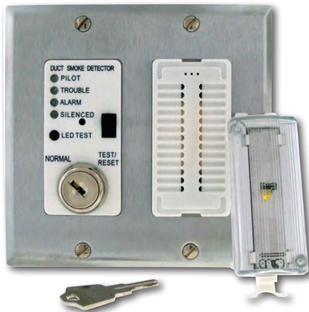
MSR-100RA/S/ with V-Plugin

NOTE: The strobe and audible buzzer features are not ADA compliant, and not intended for life safety notification or evacuation purposes (public mode). These functions are for duct smoke detector status indication only (private mode).