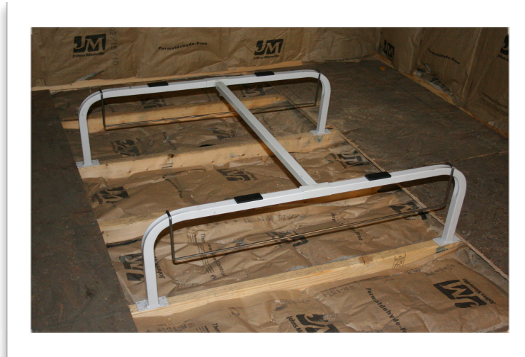
Quick Stand SPECS QSTD2000

Applicable for residential or light commercial installations