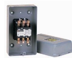
PC Series Magnetic Power Contactors