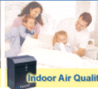
Indoor Air Quality