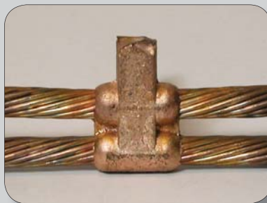
A completed UltraShot® connection