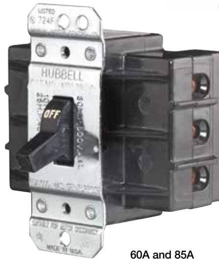
60A and 85A