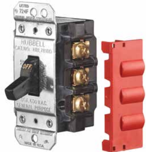
30A, 40A and 50A