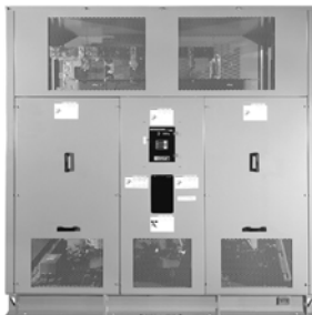
Power Dry II™