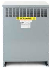
Style M—Type 2 Rated Converts to Type 3R with Weathershield