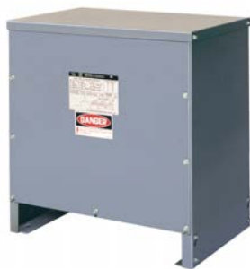
Style E—IP55 Rated

These dimensions are not for construction. Contact your local Schneider Electric representative for certified prints.