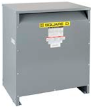
Style D and H—Type 2 Rated Converts to Type 3R with Weathershield