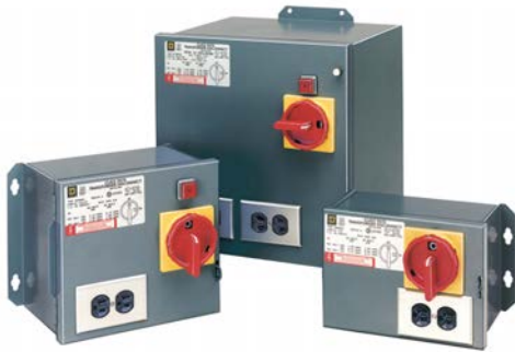
Transformer disconnects are available in NEMA Type 1 Standard, NEMA Type 12 Standard, and NEMA Type 1 Mini.

Square D™ brand transformer disconnects mount inside or outside a control system enclosure. The transformer disconnect being connected directly to the 480 Vac system controls power for auxiliary, single-phase loads when the main three-phase disconnect is either ON or OFF. The transformer disconnect is normally wired to the line side of the control panel's main disconnect.