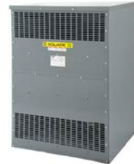
Style J—Type 1 Rated Converts to Type 2 with Drip Shield Converts to Type 3R with Weathershield