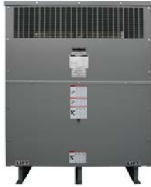
Style D, NEMA 1 Rated