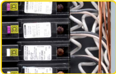
▲ Pigtail Neutral connection