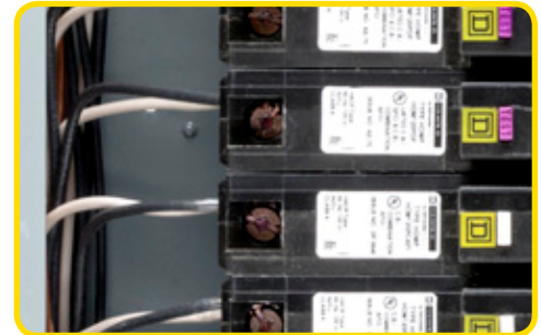
▲ Plug-on Neutral connection

★ With exclusive features including cutting edge circuit protection and TIME SAVER Diagnostics, Homeline Load Centers are the smart choice for value-minded contractors, remodelers, builders, and homeowners. Whatever your requirements are, Square D has a solution to meet your needs.