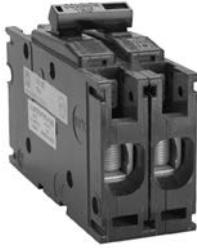
High Ampere QOU