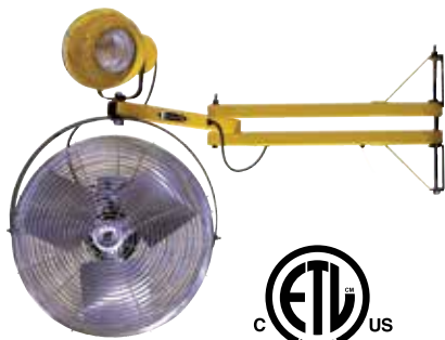
DKL-INC mounted on 40-LDF-TE (above)