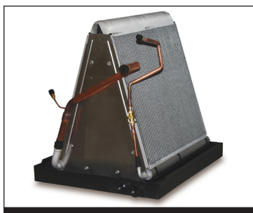
Indoor Coil - Microchannel (All Aluminum) Construction