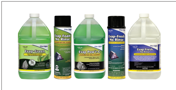
EVAPORATOR COIL CLEANERS