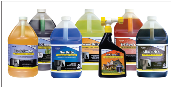
CONDENSER COIL CLEANERS

Regular cleaning with Nu-Calgon products protects equipment and helps maintain peak operating efficiency.