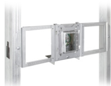
LVBS-4-158 shown installed on SSB-T5

For box and adapter assembly combinations not listed above, please contact info@orbitprofab.com. Please state the specific ring type, box size and depth, and any other pertinent notes (such as the addition of ground pigtails or firestop).