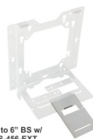
Up to 6" BS w/ FS-456-EXT