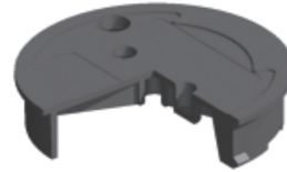
T Cover Solid