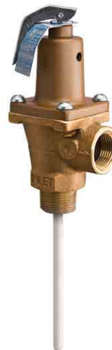
Series LF40L and LF40XL

*The wetted surface of this product contacted by consumable water contains less than 0.25% of lead by weight.