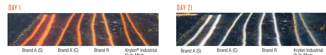
Per APWA color code guidelines, orange indicates phone lines, while white indicates proposed excavation

It's critical that the marks you make retain the appropriate color, avoiding potentially dangerous situations. Quik-Mark® Inverted Marking Paints feature an advanced, UV-resistant, fast-drying formula that won't fade in extreme sun and adheres to hot, cold or wet surfaces. You can trust Quik-Mark to ensure that the skill and hard work you demonstrate on each locate won't be undone by the elements.