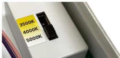
CCT selectable switch